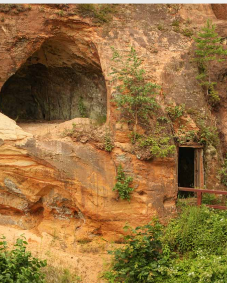
Caves in Līgatne