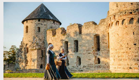
Cēsis Medieval Castle

16 | Cēsis Medieval Castle 17 | Cēsis New Castle