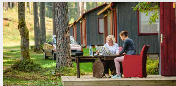
Leisure park and camping site "Ozolkalns"