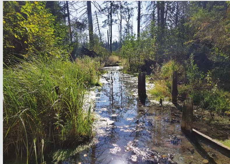
Zušu Sulphur Springs

i Description. The route is suitable for active cyclists and leads to the Sigulda region, More Parish, which historically originated from the four manors in the neighbourhood. The road section is surrounded by several hills and the Sudas swamp area, making the winding gravel covered road very interesting for travellers. The route includes several attractions of cultural heritage.