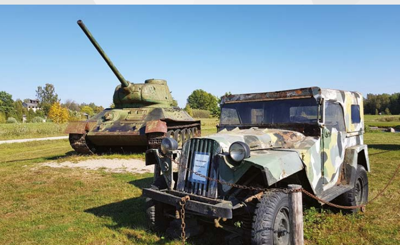
Mores kauju muzejs

The commemorative sign was placed in "Peļņi" in More Parish where the riflemen of the 5th Zemgale Regiment commanded by the Colonel Vācietis on 18 September, 1917, stopped the attack of the Imperial Germany 8th Armed Forces in the direction of Nītaure and the 2nd Latvian Riflemen Brigade started a counter attack, pressing back the German forces up to Mālpils, therefore the First World War basically ended for the Latvian riflemen.