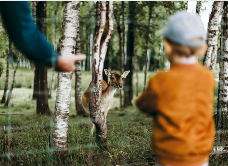
Deer Garden "More"