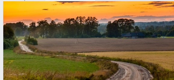
Landscape in Gauja National Park