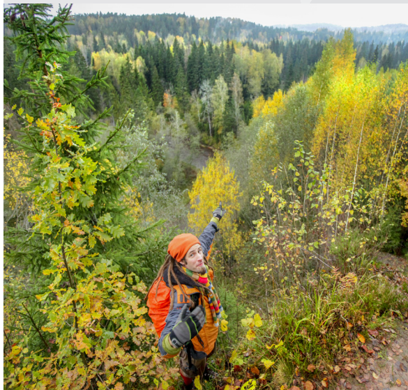
View from Ainavu Cliff