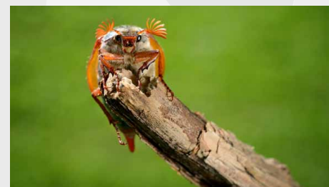
Chaffer Beetle ( Melolontha melolontha )