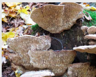
The Thin-maze Flat Polypores ( Daedaleopsis confragosa )

Murjāņi is associated with the Murjāņi Sports Dormitory School (now – Murjāņi Sports Gymnasium) established in 1965, where along various sports disciplines the students get also general secondary education.