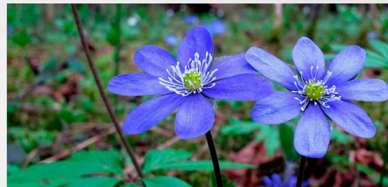
Blue Anemones ( Hepatica nobilis )