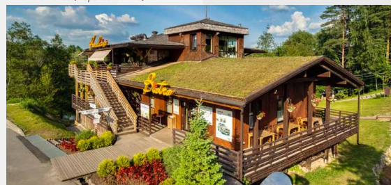
Leisure Park "Rāmkalni"