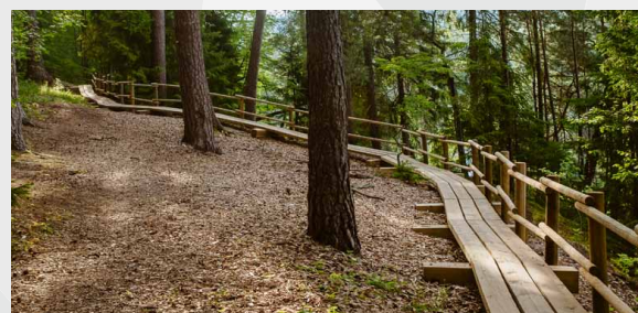
Trait in Gauja National Park

Deep ravine with a small brook dividing the left initial bank of the primeval valley of the River Gauja. On the southern side, there are stairs leading down to the riverside.