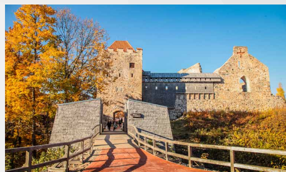
Castle of Livonian Order in Sigulda