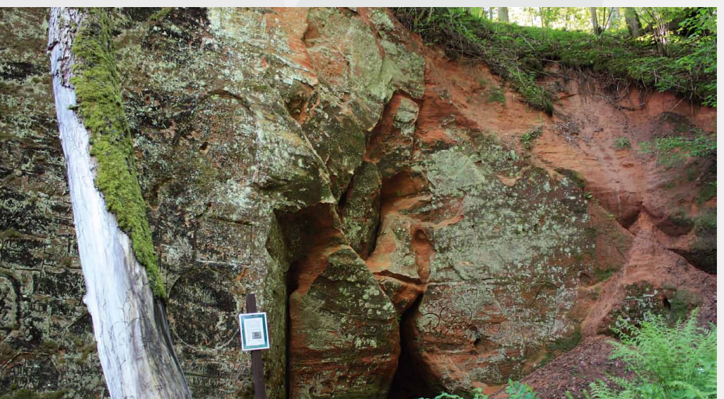
/iew from Paradizes (Gleznotājkalns) Hill