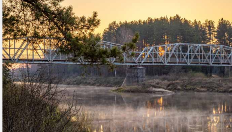
rossing River Gauja