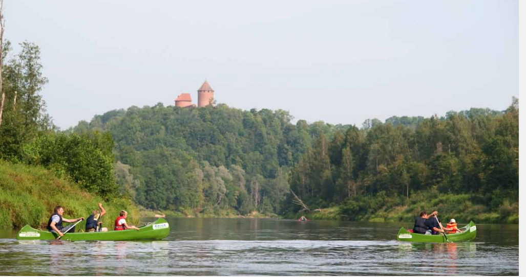
View of Turaida Castle from River Gauja